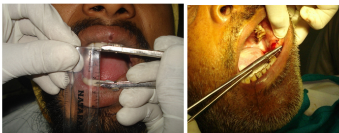
[Table/Fig-1]: Method of measuring mouth opening [Table/Fig-2]: Incisional Biopsy